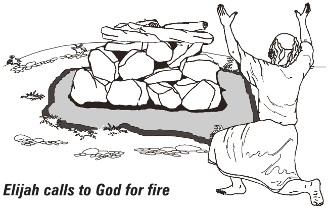
Elijah calls to God for fire

Then Elijah said to all the people, "Come near to me"; and all the people came near to him. And he repaired the altar of the LORD that had been thrown down; Elijah took twelve stones, according to the number of the tribes of the sons of Jacob, and with the stones he built an altar in the name of the LORD.